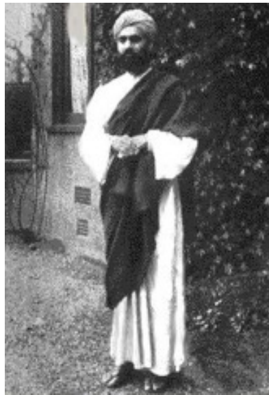
Sadhu Sundar Singh

Before the evening Sundar left home, an attempt had already been made on his life by poison, so that the new convert should not live to be a disgrace for the noble Singh family. Poison had been mixed in his food. When he reached the house of a Christian for shelter, the poison began to work and he was nearly dying. The doctor who was called, refused to give him any medicine, as he knew the young man was beyond hope, and that if he treated him he might be blamed for his death. But Sundar boldly claimed Christ's healing power, and he was soon well. The doctor was so deeply impressed at the healing, that he became a Christian, and eventually entered the ministry. Our modern Saul thus faced the attempt on his life soon after conversion, not through those who "watched the Damascus gate day and night to kill him," but by his own folks who poisoned his food. To Saul the deliverance came through a basket let down by the wall; to Sundar it came as the miraculous fulfillment of Christ's promise: "And if they drink any deadly thing, it shall not hurt them." Saul's conversion was followed by a healing of