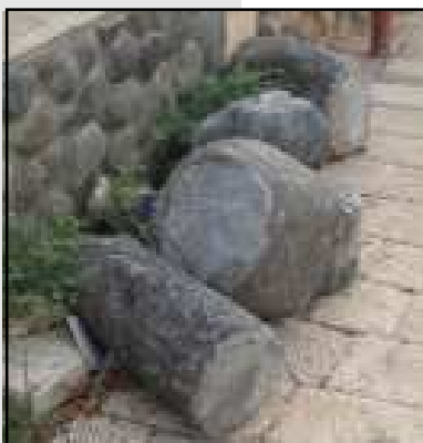
Roman column fragments